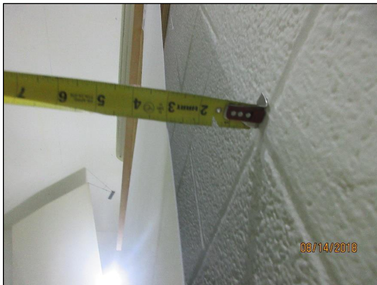
Photo No. 2 Side View of Installed Specimen