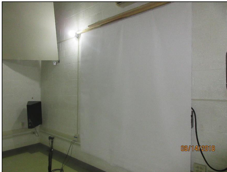
Photo No. 1 View of Installed specimen