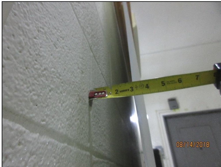
Photo No. 2 Side View of Installed Specimen