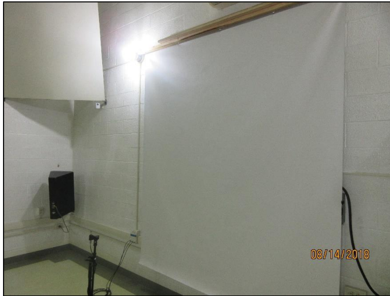
Photo No. 1 View of Installed Specimen