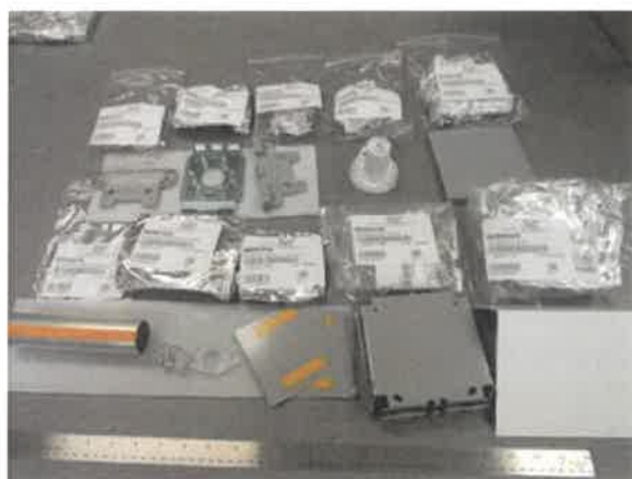
Photo Documentation – The product sample specimen is photographed immediately following specimen preparation and prior to initiating the test. Typically, the top and bottom faces of the specimen are photographed. Bottom faces may show a stainless steel plate or other substrate if required by the test.