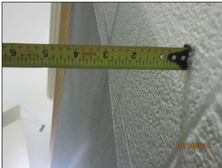
Photo No. 2 Side View of Installed Specimen