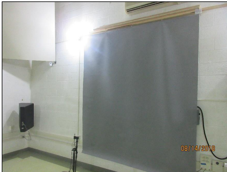
Photo No. 1 View of Installed Specimen