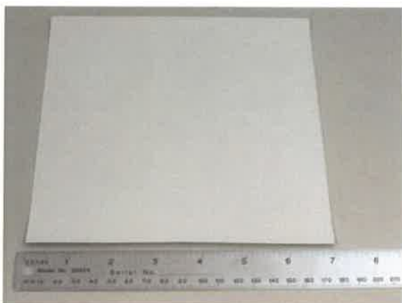
Photo Documentation – The product sample specimen is photographed immediately following specimen preparation and prior to initiating the conditioning period. Typically, the top and bottom faces of the specimen are photographed.